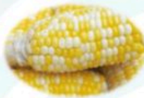
Corn On The Cob